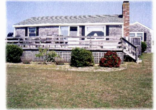
Sea Drift Cottage