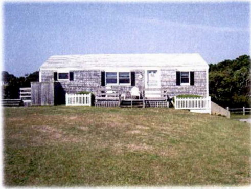
Sea Breeze Cottage